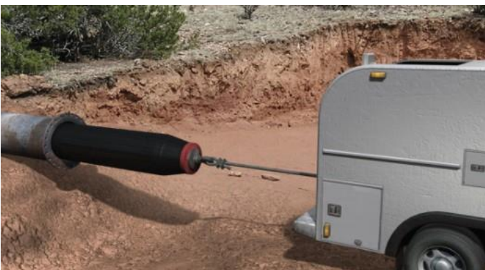
Fig. 3: Liner Under Tension

The liner is pulled through a series of hydraulic rollers, temporarily reducing the liner's diameter while it is installed inside the pipeline section.