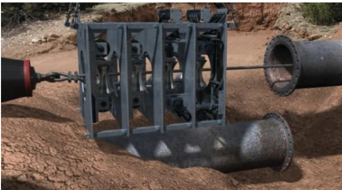
Fig. 1: Steel Cable and Roller Reduction Box

3 When the tension is released, the liner pipe expands, creating a tight fit against the inner wall of the steel pipe (Fig. 4). Following relaxation of the liner pipe, custom manufactured polyethylene flange-fittings are attached at each end of the lined section. A steel spacer ring is placed around the raised face of the steel flange and the polyethylene flange-fitting to help ensure a leak-free connection. The two steel flanges are positioned together and the line is tested and bolted-up before placing in service.