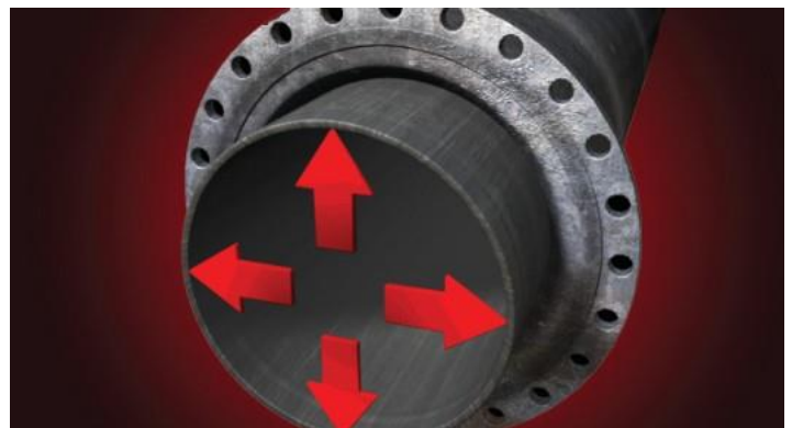
Fig. 4: Tight Fit Created

The wireline unit keeps the liner under tension as it is pulled into the host pipe.